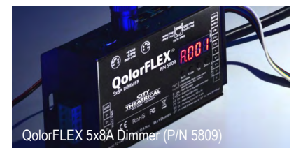
QolorFLEX 5x8A Dimmer (P/N 5809)