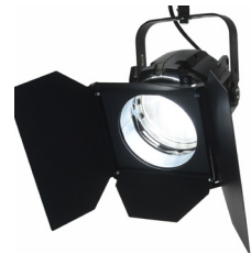
City Theatrical's OEM manufacturing includes metal beam shaping accessories for lighting companies