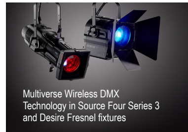
Multiverse Wireless DMX Technology in Source Four Series 3 and Desire Fresnel fixtures