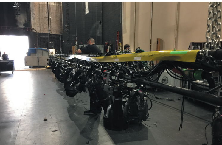
↑ RDM is the quickest and easiest way to ring out a lighting rig

fixtures have to have RDM in order to take advantage of it. The vast majority of fixtures being manufactured today do have RDM, so its time has finally come.