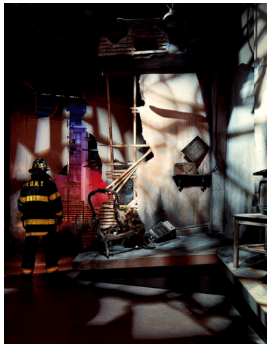
The FDNY Fire Zone at Rockefeller Center on W. 51st Street. A permanent installation for the Fire Department of New York that teaches visitors about fire safety and fire prevention. Using video, lighting and theatrical smoke, it teaches people about the five most common causes of fire in the home, how to prevent those fires, and how to successfully escape those fires.

CTI: If you had it to do all over again, would you do anything differently?