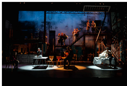
Rent at Syracuse Stage