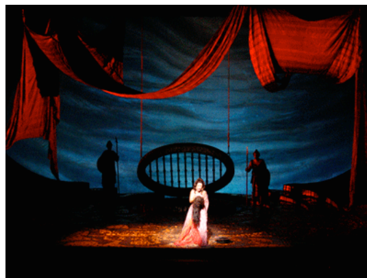
Salome at the Orlando Opera