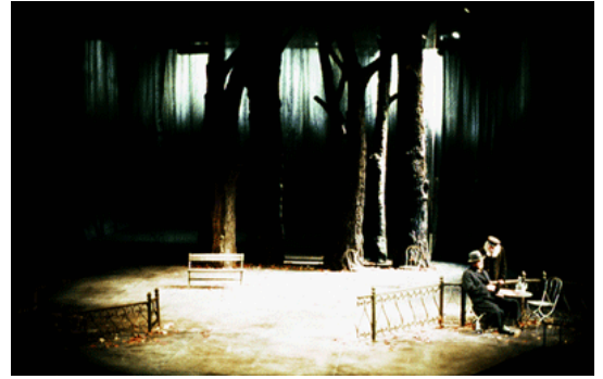
Three Sisters at the Guthrie Theatre

Do your best, always. And by all means, have fun!