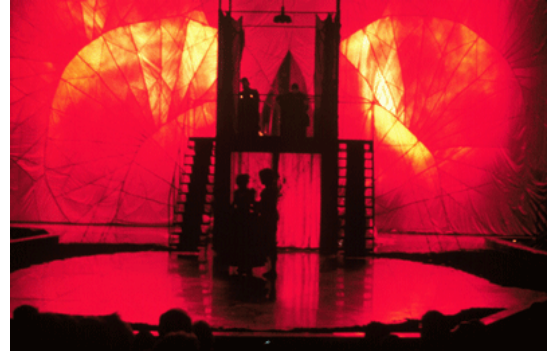
Twelfth Night at the Guthrie Theatre