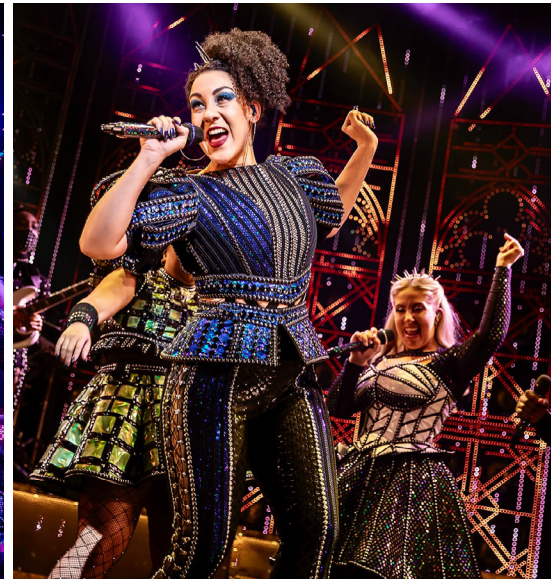
SiX The Musical London.