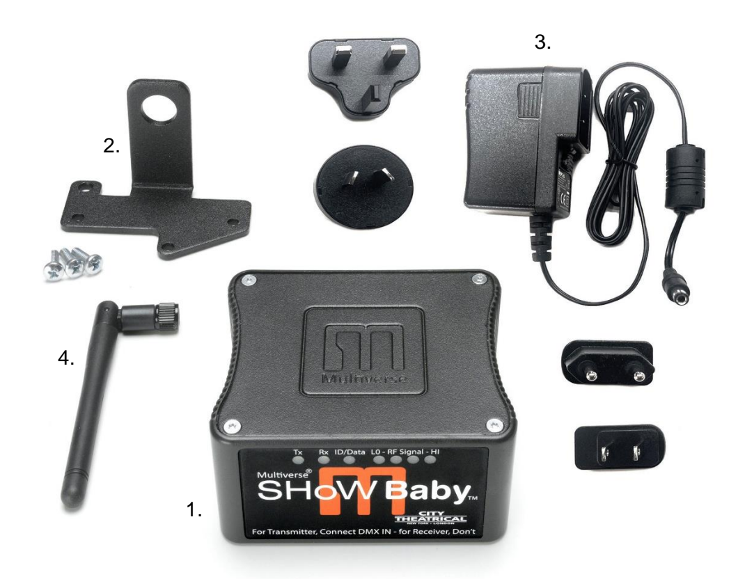
Figure 3: What's Included