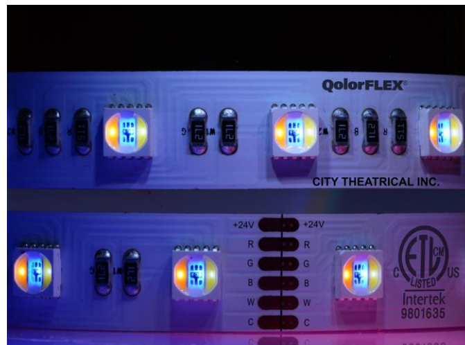
QolorFLEX 5-in-1 HiQ High CRI LED Tape is 25% brighter than other 5-in-1 LED tapes, including best-selling QolorFLEX 5-in-1 LED Tape, RGB + Amber + Cool White.