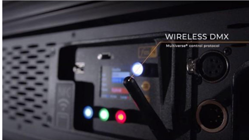
City Theatrical Multiverse® wireless DMX/RDM technology comes onboard in various light fixtures by ETC, including the fos/4 Panel.