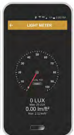
Light Meter (Android only)