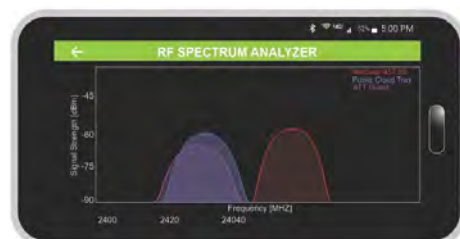
RF Spectrum Analyzer (Android only)