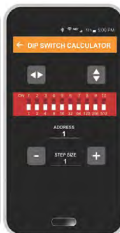
DIP Switch Calculator