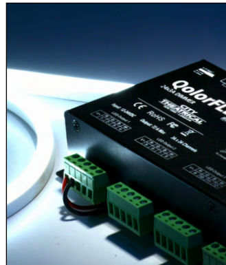
QolorFLEX 24x3A Dimmer shown controlling QolorFLEX LED Tape (left) and QolorFLEX® NuNeon (right).