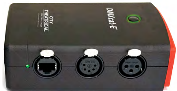
DMXcat-E hardware, side view