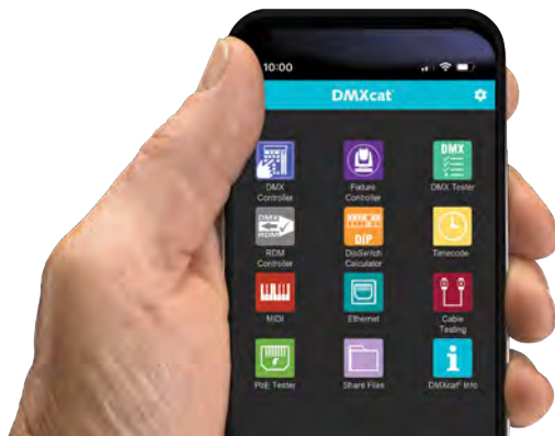
The DMXcat app includes new DMXcat-E apps once connected to a device.