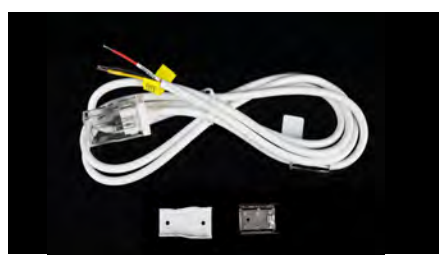
Eluxtra™ ProFlex LED Strip Light, 3-Wire Connector 01 PF-3-SPS-01-2m

This is a 3-wire, IP67 connector designed for use with Eluxtra™ ProFlex LED strip lights. It features a 2-meter lead, providing flexibility for various setups. Look for the "01" marking on your strip light to ensure you are connecting in the proper direction.