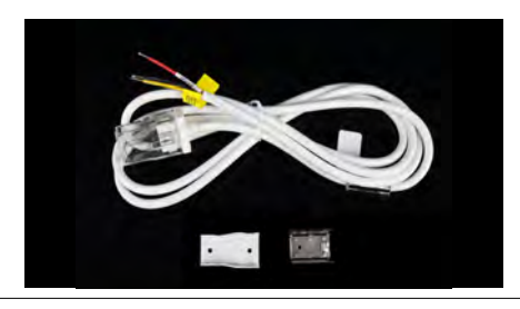
Eluxtra™ ProFlex LED Strip Light, 3-Wire Connector 02 PF-3-SPS-02-2m

This is a 3-wire, IP67 connector designed for use with Eluxtra™ ProFlex LED strip lights. It features a 2-meter lead, providing flexibility for various setups. Look for the "02" marking on your strip light to ensure you are connecting in the proper direction.