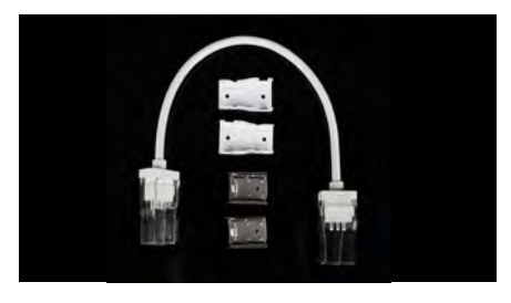
Eluxtra™ ProFlex LED Strip Light, 3-Wire Jumper PF-3-SPS-JUMP-300mm

This is a 3-wire, IP67 jumper designed to connect two sections of Eluxtra™ ProFlex LED strip lights that have been cut to custom lengths. Look for the "01" and "02" markings on your strip light to ensure you are connecting in the proper direction.