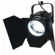
City Theatrical's OEM manufacturing includes metal beam shaping accessories for lighting companies