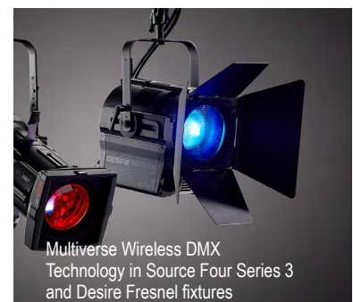
Multiverse Wireless DMX Technology in Source Four Series 3 and Desire Fresnel fixtures

Call us to discuss what we could do for your products.