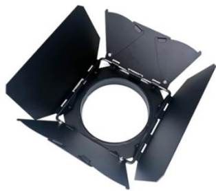
2631 Barndoor for ETC fos/4 Fresnel 5

City Theatrical now offers standard beam control accessories designed to fit various professional light fixtures, including ETC's fos/4 Fresnel fixtures for film and video projects, Martin Professional's ERA 800 Performance and MAC Ultra Performance , and GLP's Impression X4 S . These new beam control accessories were developed based on City Theatrical's understanding of the unique accessory needs of lighting professionals, and the high demand for this moving light fixture in the market.