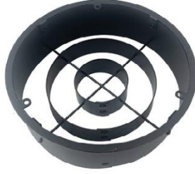
6378 GLP Impression X4 S Concentric Ring

City Theatrical designs and manufactures the most complete line of beam control accessories for German Light Products (GLP) lighting fixtures and moving lights available anywhere. City Theatrical is now shipping the new GLP Impression X4 S Concentric Ring (P/N 6378).