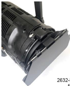
2632-LLS Light Leak Shield for ETC fos/4 and Desire Fresnel 7

City Theatrical now offers beam control accessories for ETC fos/4 Fresnel products, including the new Barndoor for ETC fos/4 Fresnel 5 (P/N 2631), which comes in addition to City Theatrical's Barndoor for ETC fos/4 Fresnel 7 (P/N 2632) and Barndoor for ETC fos/4 Fresnel 10 (P/N 2633).