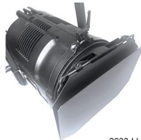
2633-LLS Light Leak Shield for ETC fos/4 and Desire Fresnel 10

US HEADQUARTERS 475 BARELL AVENUE CARLSTADT, NEW JERSEY 07072 TEL 800 230 9497 / 201 549 1160 FAX 201 549 1161