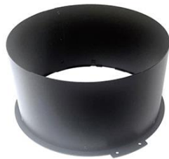
2799S Top Hat for MAC Ultra Performance, 4"

City Theatrical currently offers 45+ styles of beam control accessories for 16 different Martin Lighting moving light fixtures, which are available through the City Theatrical dealer network. City Theatrical's new Martin Professional ERA 800 Performance Top Hat (P/N 2820) is a new Standard Top Hat that serves two functions when using this ERA 800 Performance fixture for an entertainment lighting project: To control light spill, or to reduce the viewing angle to the lens. City Theatrical is also now shipping a Concentric Ring (P/N 2821) and Hexcel Louvers (P/N 2822) as beam control accessories for the Martin Professional ERA 800 Performance fixture, as well as a Mount Kit for the Martin ERA 800 Performance (P/N 104-00810).