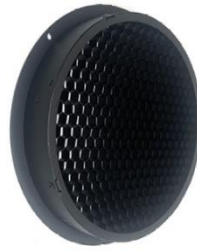
2822 ERA 800 Performance Hexcel Louver