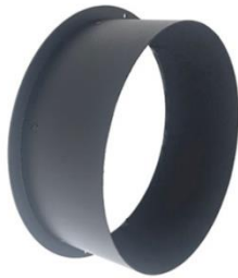
2820 ERA 800 Performance Top Hat

To complement City Theatrical's Barndoors for ETC fos/4 Fresnel 7 and 10, City Theatrical developed the new Light Leak Shield for ETC fos/4 Desire and Fresnel 7 (P/N 2632-LLS) and the new Light Leak Shield for ETC's fos/4 Fresnel 10 (P/N 2633-LLS) to enhance the use of these Barndoors to control light spill with even greater precision. These beam control accessory product launches come as a part of City Theatrical's accessory enhancement of ETC's line of fos/4 Fresnel lighting fixtures for film and video projects. ETC's fos/4 lighting fixtures also come with onboard City Theatrical Multiverse® wireless DMX/RDM technology.