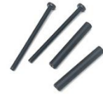
104-00810 Mount Kit for ERA 800 Performance

City Theatrical currently offers 45+ styles of beam control accessories for 16 different Martin Lighting moving light fixtures, which are available through the City Theatrical dealer network. City Theatrical's new Martin Professional ERA 800 Performance Top Hat (P/N 2820) is a new Standard Top Hat that serves two functions when using this ERA 800 Performance fixture for an entertainment lighting project: To control light spill, or to reduce the viewing angle to the lens. City Theatrical is also now shipping a Concentric Ring (P/N 2821) and Hexcel Louvers (P/N 2822) as beam control accessories for the Martin Professional ERA 800 Performance fixture, as well as a Mount Kit for the Martin ERA 800 Performance (P/N 104-00810).