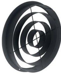
2821 ERA 800 Performance Concentric Ring