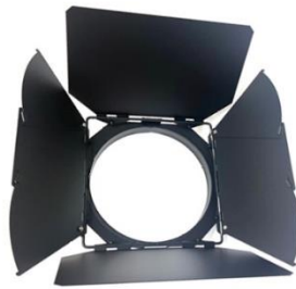
2632 Barndoor for ETC fos/4 and Desire Fresnel 7