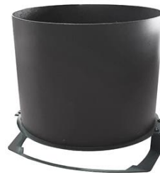
2799 Top Hat for MAC Ultra Performance

City Theatrical is also launching a new 4-inch Top Hat for Martin Professional's MAC Ultra Performance (P/N 2799S), which is a shorter version of City Theatrical's Standard Top Hat for the MAC Ultra Performance (P/N 2799).