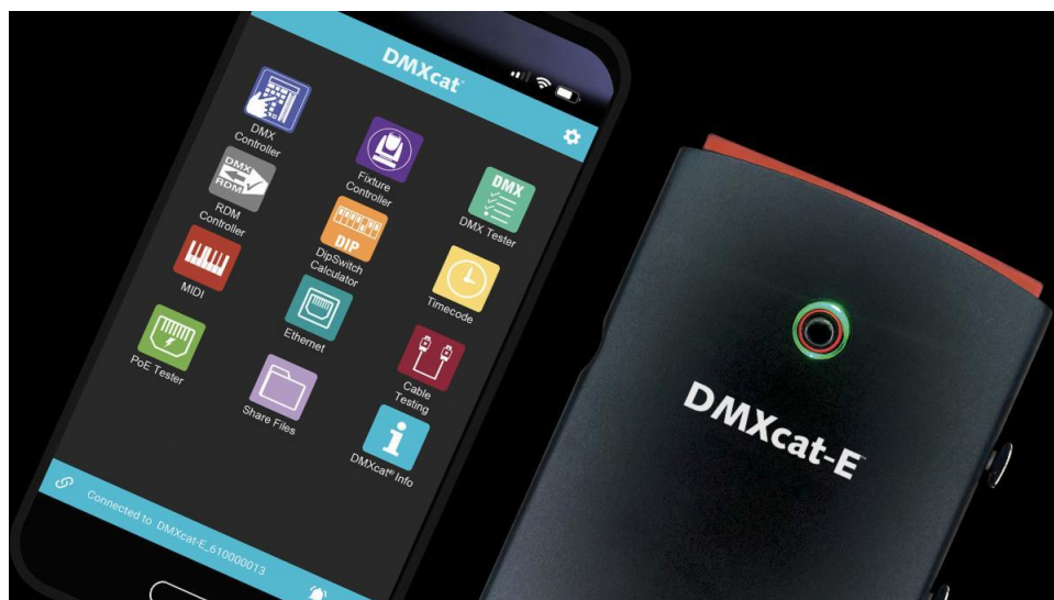
City Theatrical's new DMXcat-E (P/N 6100) allows users to view and send Ethernet protocols, including ArtNet and Streaming ACN (sACN) among others, as well as perform cable testing of 5-pin XLR and Ethernet cables.

For more information on City Theatrical's 2025 Events schedule, visit: https://www.citytheatrical.com/events