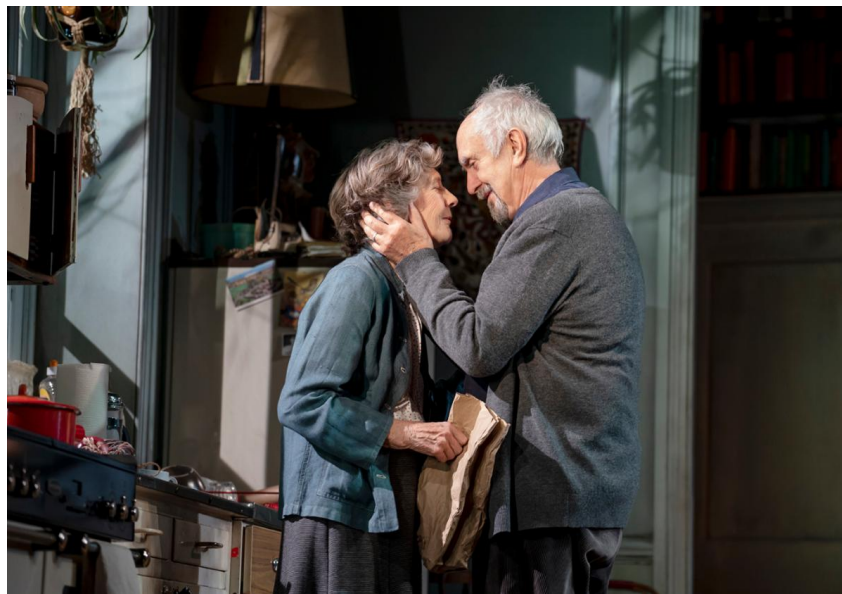
Eileen Atkins and Jonathan Pryce in The Height Of The Storm

Wednesday Matinee... see The Height Of The Storm at the Samuel J. Friedman Theatre in New York City. Products by City Theatrical include Standard Top Hats , Martin Top Hats for MAC Encore, Martin Louvers for MAC Aura, and Blacktak™ Light Mask Foil . Lighting software used includes Lightwright® 6 , Moving Light Assistant™ , and Vectorworks Spotlight .