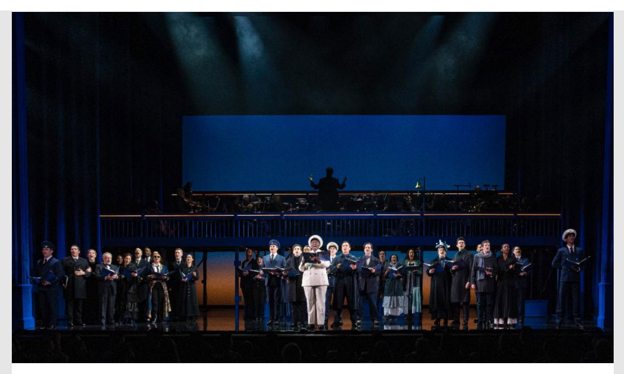
The cast of Titanic at New York City Center.

Wednesday Matinee... See <u>Titanic</u> at New York City Center in New York City. Products by City Theatrical include <u>DMXcat® Multi Function</u> <u>Test Tool</u>, <u>QolorFLEX® 24x3A Dimmers</u>, <u>Broadway Music Stand Lights</u>, <u>GLP X4 Hexcel Louvers</u>, <u>GLP X4XL Hexcel Louvers</u>, <u>GLP X4S Concentric Rings</u>, <u>Martin MAC Encore Performance Top Hats</u>, <u>MAC Ultra Performance Top Hats</u>, and <u>Safer Sidearms™</u>, including Steel Safer Sidearms and Safer Sidearms Junior.