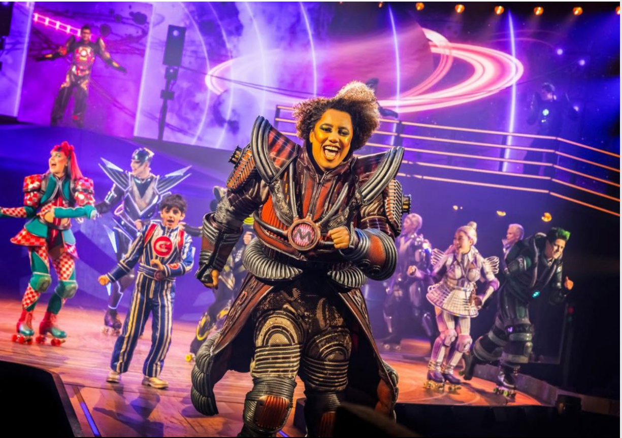
The cast of Starlight Express at Troubadour Wembley Park Theatre.