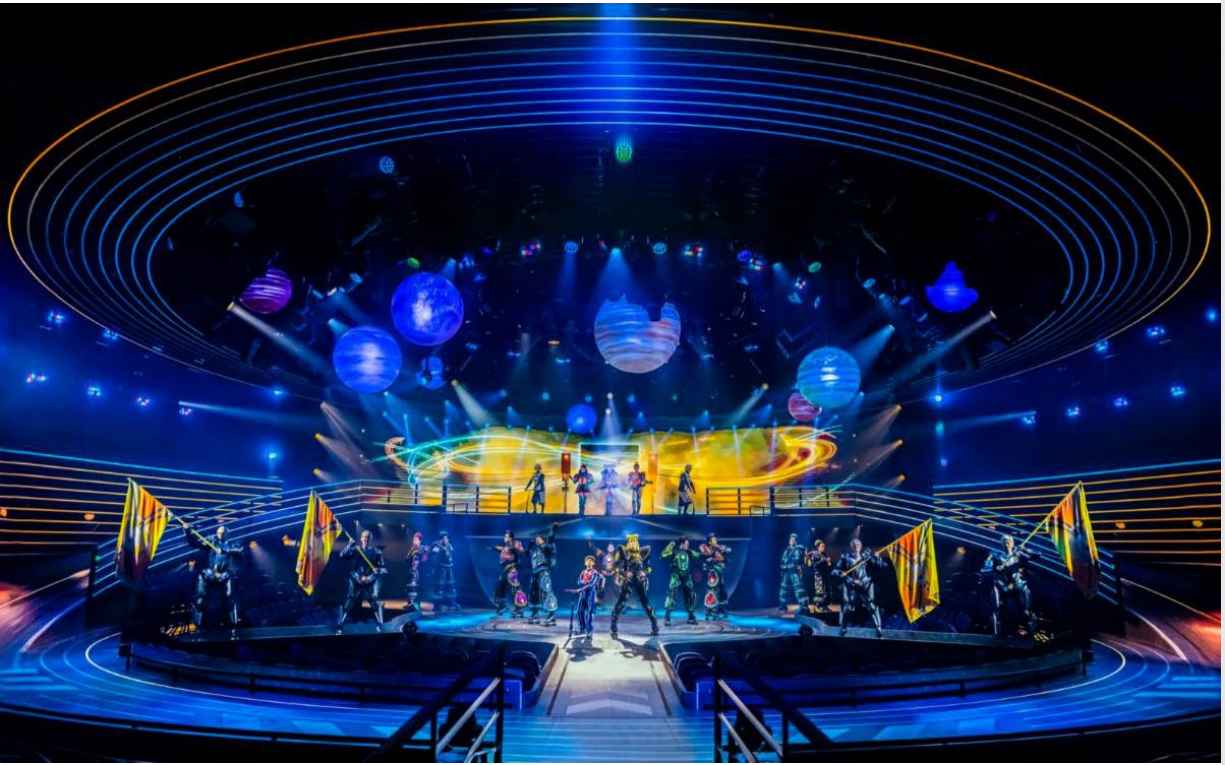
The cast of Starlight Express at Troubadour Wembley Park Theatre

Wednesday Matinee... See Starlight Express at the Troubadour Wembley Park Theatre in London. Products by City Theatrical include DMXcat® Multi Function Test Tool , QolorFLEX® RGBI LED Tape , Standard Top Hats , MAC Aura PXL Concentric Rings , MAC One Concentric Rings , MAC Aura XB Egg Crate Louvres , and Safer Sidearms™ . Software used includes Moving Light Assistant™ .