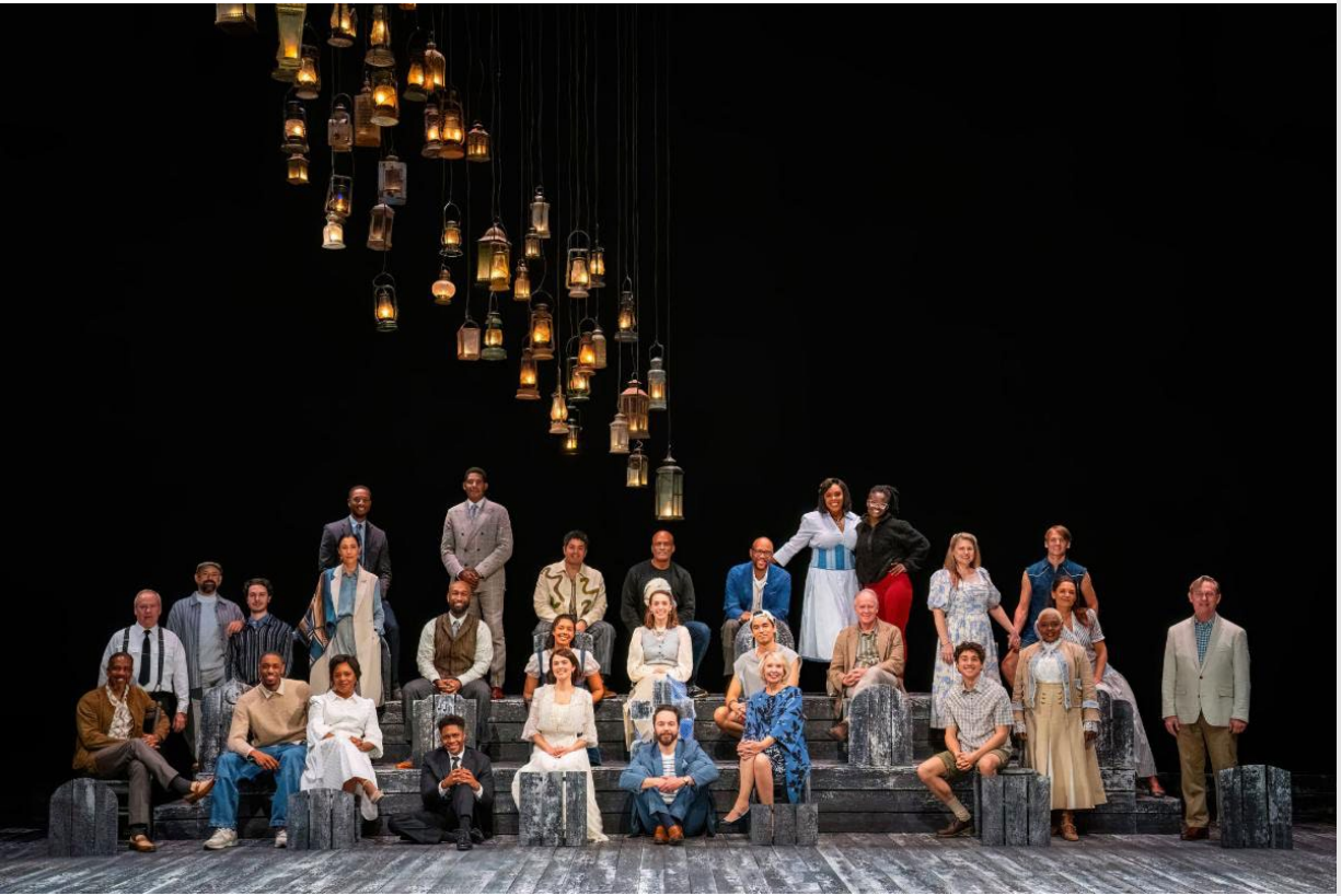
Kenny Leon and the full cast of Our Town

Wednesday Matinee... See Thornton Wilder's Our Town at the Ethel Barrymore Theatre. Products by City Theatrical include Multiverse® Transmitter and Multiverse Nodes for wireless DMX/RDM, Standard Top Hats , MAC Encore Performance Top Hats , GLP Impression X5 Concentric Rings , Safer Sidearms™ , Vertical Extension Tubes , and Blacktak™ Light Mask Foil . Software used includes Moving Light Assistant™ .