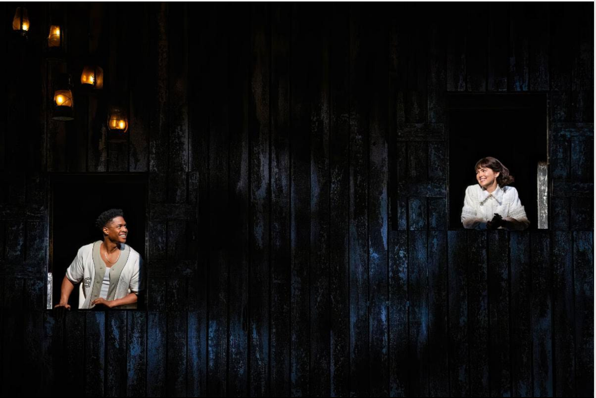
Ephraim Sykes as George Gibbs and Zoey Deutch as Emily Webb in Our Town