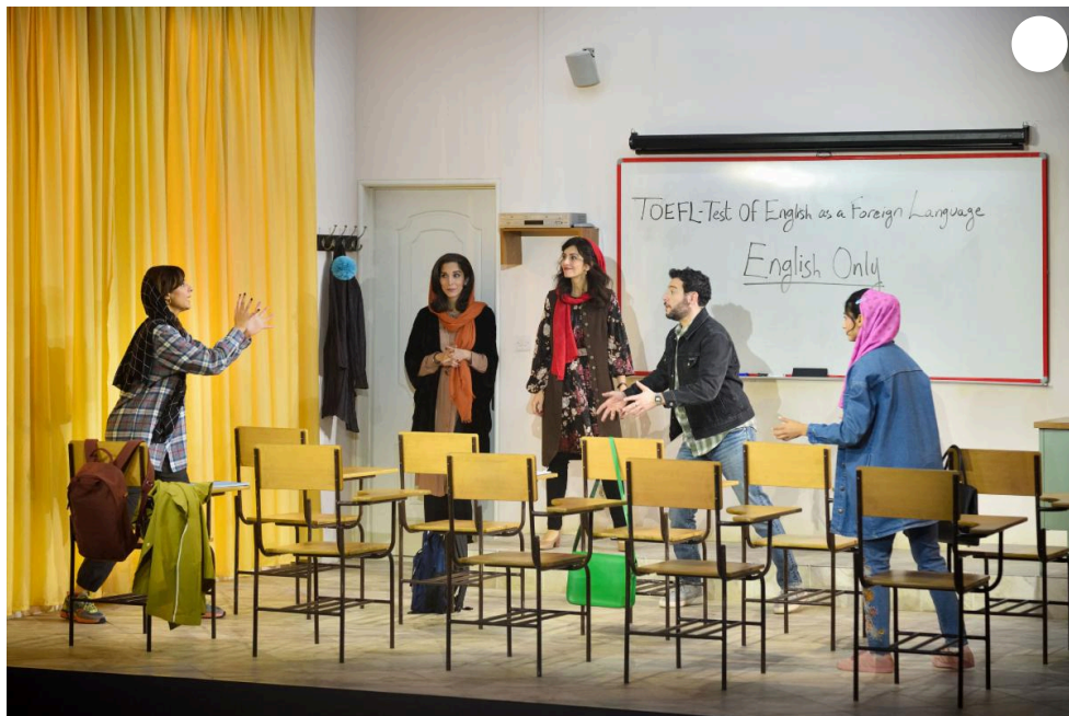
The cast of English at the Todd Haines Theatre

Wednesday Matinee... See English at the Todd Haines Theatre in New York City. Products by City Theatrical include Multiverse® Nodes for wireless DMX/RDM, Standard Top Hats , and Safer Sidearms™ .