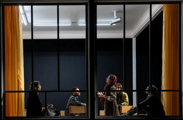
The cast of English at the Todd Haines Theatre